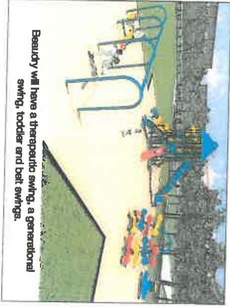
Beauty will have a therapeutic swing, a generational swing, toddler and belt swings.