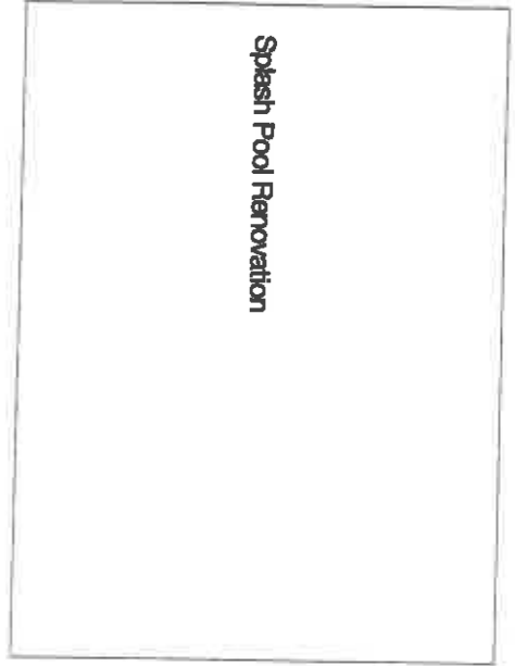
Splash Pool Renovation