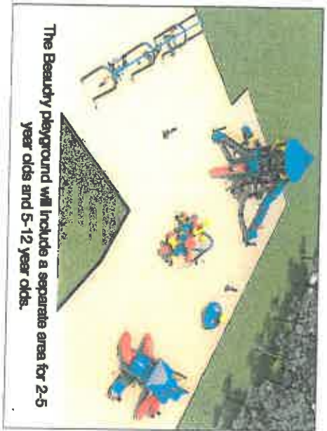
The Beauty playground will include a separate area for 2-5 year olds and 5-12 year olds.